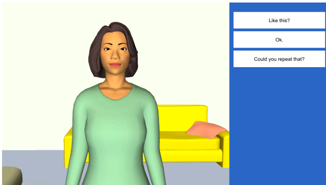
Figure 1. Affectively-Aware Agent.

Based on the rules we identified, we developed a prototype of an affectively-aware depression counseling system. Since the goal of our system was to recreate one-on-one face-to-face therapeutic interactions with a human counselor, we decided to use an embodied conversational agent, an animated computer character that emulates face-to-face conversations through both verbal and non-verbal behavior, as our interface (Figure 1).